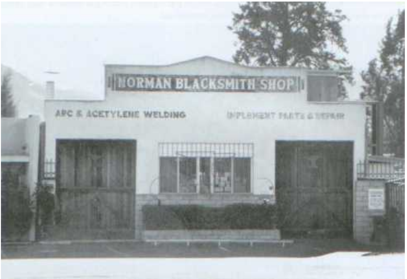
Norman Blacksmith Shop was in business on Dawson Drive from 1941-2011

additional branding irons were ever needed, the replacements could then be tested against the imprint to see if they were exactly the same.”