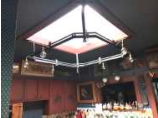
Custom designed a light fixture beneath the skylight.

The skylight "is one of our favorite pieces." -Tom Nuckols