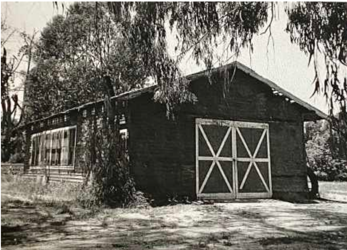
Camarillo Ranch Blacksmith Shop built in 1916.

In a property inventory and preparation of a site map, the blacksmith shop, along with several other buildings on the Camarillo Ranch were photographed and documented in 1998. Students, who visit the Ranch on School Tours, learn that the blacksmith held the essential job of creating and maintaining equipment. They also see a variety of blacksmith tools and horseshoes.