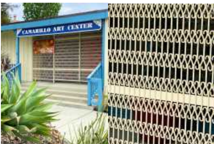
Camarillo Art Center gates. Detail of gates on right.