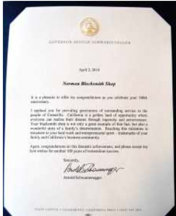
Recognition from the State of California