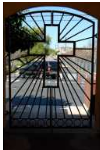
St. Mary Magdalen Chapel gate