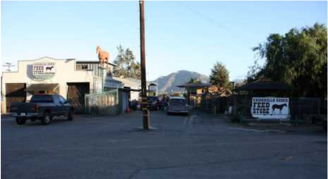
The Norman Blacksmith Shop was leased to Camarillo Somis Feed Store 234 South Dawson Drive near the Lewis Road overpass