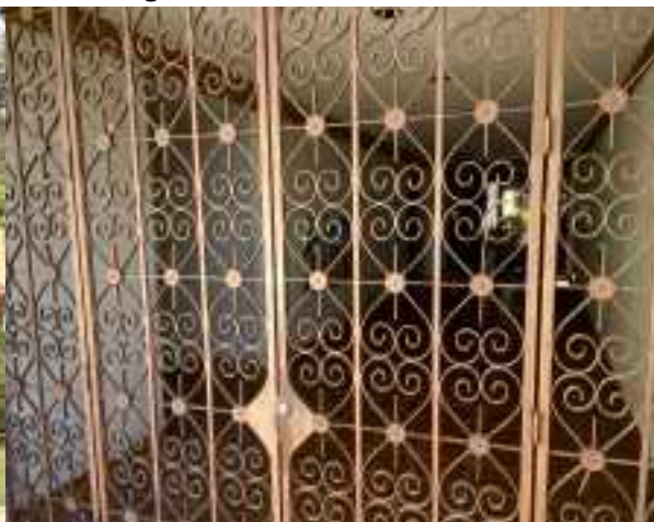
Former Camarillo Library (1974-2007) on Ponderosa Drive