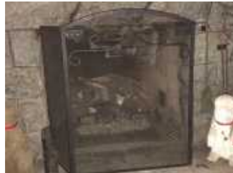
Other fireplace screens for Nuckols family