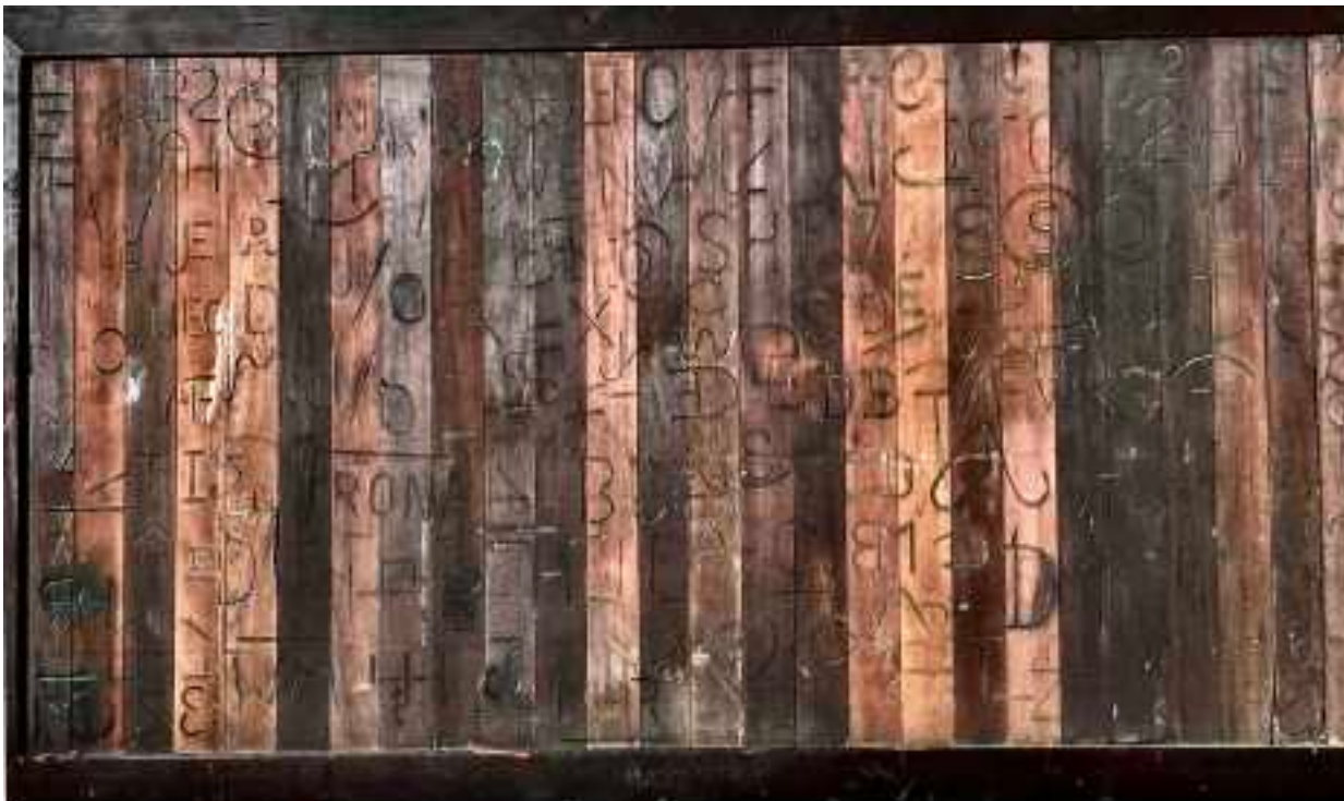
Brands made by the Norman family of blacksmiths documented cattle history in Ventura County.

Each branding iron was scorched upon the shop door. When the shop finally closed in 2011, the Ventura County Cattlemen’s Association and the Museum of Ventura County-Agricultural Museum received the door. Ongoing research to identify the brands is underway. It is a complex study to name and date these brands and their ranches.