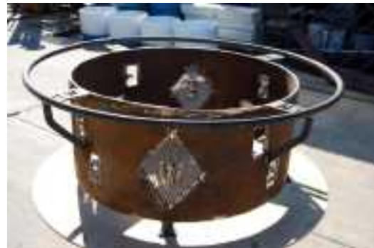
The firepit was made for the Boy Scout office in Camarillo.